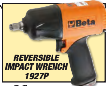
REVERSIBLE IMPACT WRENCH 1927P