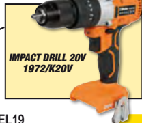
IMPACT DRILL 20V 1972/K20V